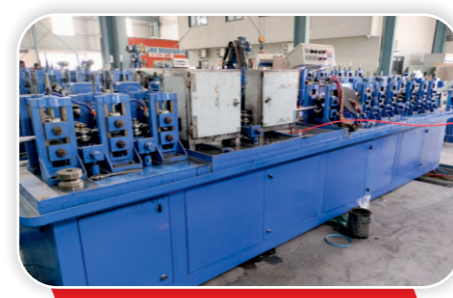
S.S. Pipe Forming & Welding