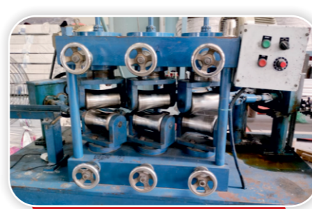
S.S. Pipe Straightening