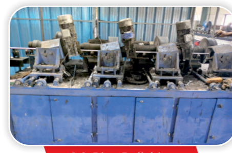
S.S. Pipe Polishing

Specialist in Thinwall Pipes (Square & Round)